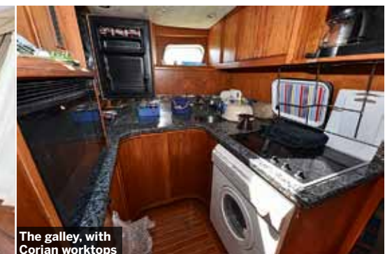
The galley, with Corian worktops