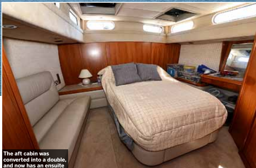
The aft cabin was converted into a double, and now has an ensuite

'Man maths' helped justify Gary's decision to purchase White Mouse II from the Glass family in 2009