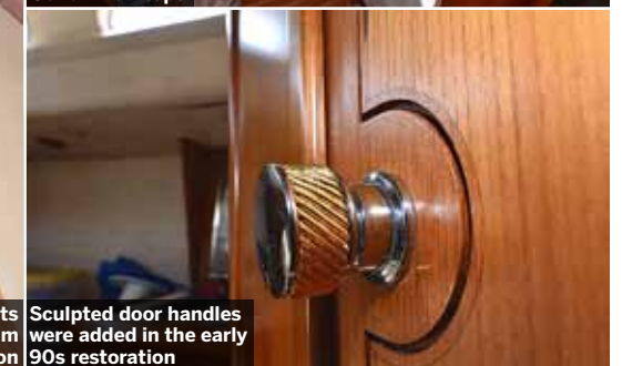
Sculpted door handles were added in the early 90s restoration