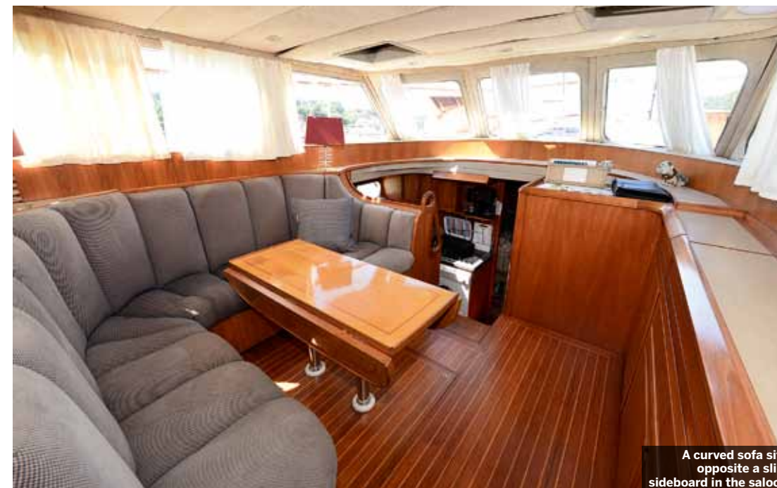
A curved sofa sits opposite a slim sideboard in the saloon

The original layout featured a crew cabin forward ahead of a galley and heads. The next level up was a simple saloon and steps that led to a wheelhouse with a small cockpit behind it. Back aft were two cabins, the rearmost one with twin beds, the second smaller room having bunks. The revamp saw the wheelhouse lengthened to enclose the small cockpit while the saloon on the lower level was fitted with a curving sweep of sofa around a large table opposite a sideboard. And while the galley stayed in the same place, the forward crew cabin was turned into a comfortable guest cabin with a central double bed. The previously central aft companionway was moved to starboard allowing the forward of the two cabins to have its twin bunks transversely. The heads was then positioned between it and the aft cabin, allowing both to become ensuite. The aft cabin itself was converted to a central double berth from the rather unsociable twin beds.